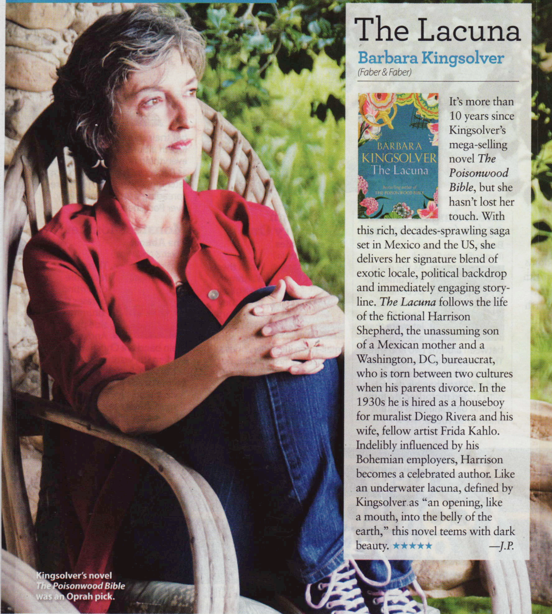
Kingsolver's novel The Poisonwood Bible was an Oprah pick.